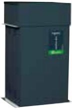
Box (Square) Type 440V Capacitors